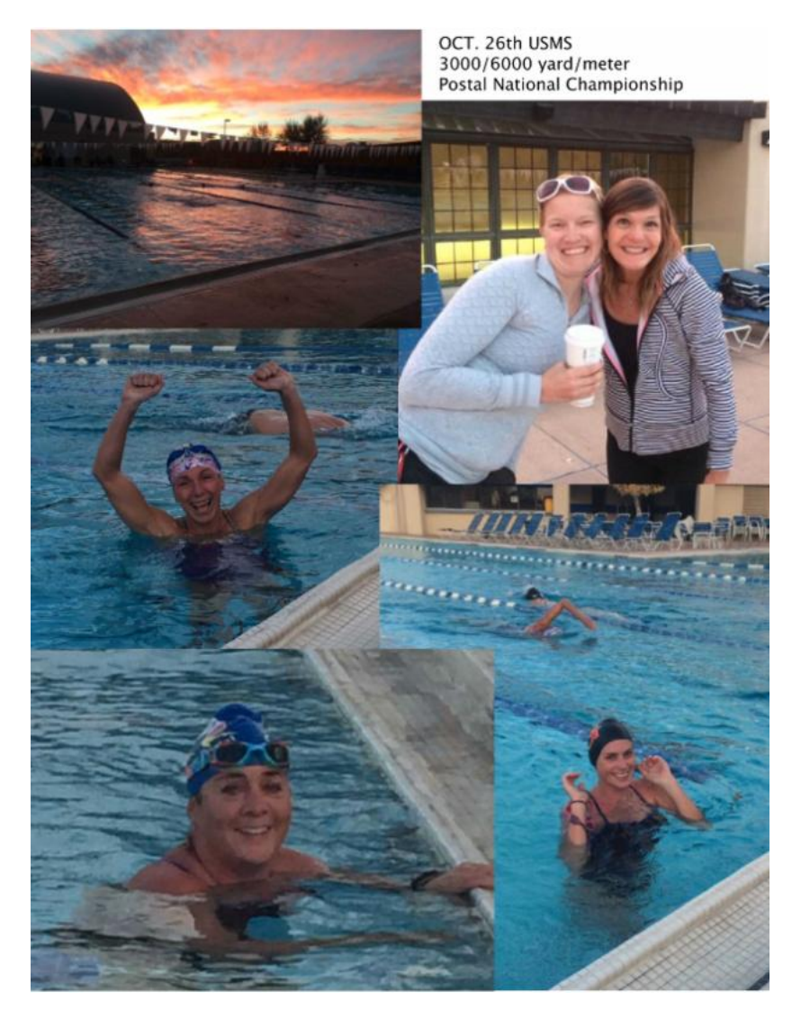
The Next 2014 USMS Speedo 3000/6000 yd. National Postal Championship Swim: November 9th, 7:00 am Colorado Athletic Club at Inverness

Fall is definitely in the air, the leaves are changing color, Football Season has officially started and most outdoor pools have closed. In keeping with tradition, it must be time to swim the last 2 events in the USMS Speedo National ePostal Series! Yes indeed sports fans, the 2014 USMS Speedo 3000/6000 yd. ePostal National Championships have begun! The objective is to swim 3000 or 6000 yards OR meters in its entirety between September 15th and November 15th. Upon completion, you officially enter your final time and splits with the Host Team, Centeral Oregon Masters, and see how you compare to swimmers all over the Country! Whether you swim for fun, fitness or competition, you will feel accomplished! In addition, if you participate, you will receive our very own Colorado Goes Postal Swim Cap.