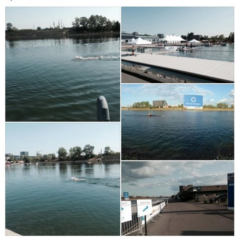
Open Water Venue