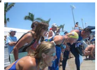
Colorado Masters cheering on a teammate at the Short Course National Championships.